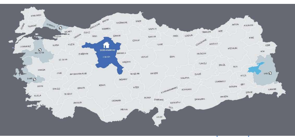
Map 1: Implementation provinces: Ankara, Antalya, Balıkesir, İstanbul, İzmir, Van. Project coordination in Ankara.

Foundation Caritas Luxembourg (FCL) and Association for Solidarity with Asylum Seekers and Migrants (ASAM) are addressing protection needs and facilitating access to available services for vulnerable asylum seekers and migrants, including unregistered and undocumented migrants through the PALS project.