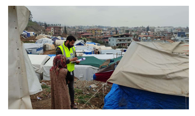
Mobile team conducting assessments on protection, WASH, shelter and needs in Gunduz-Kirikhan ITS with residents.

Assistance and Early Recovery providing WASH, shelter and livelihoods assistance with the support of Caritas Germany, Caritas Austria, NIN Austria and the MAEE Luxembourg.