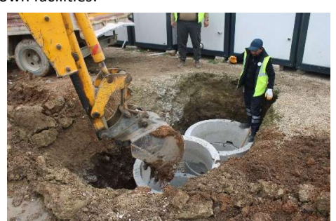
WASH team supervising septic tank installation in an ITS.

The team has advanced its interventions far beyond the initial maintenance of facilities. It now addresses problems of water and sewage connections or drainage, responds to specific needs such as the installation of septic tanks or the adaptation of sanitation units for elderly people or PWD, and mobilises communities on good hygiene practices and the need to maintain their own facilities.