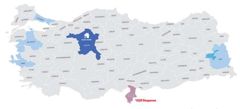
Map 1: PALS Implementation provinces: Ankara, Antalya, Balıkesir, İstanbul, İzmir, Van. EQR Response in Hatay, Project coordination in Ankara.

Foundation Caritas Luxembourg (FCL) and Association for Social Development and Aid Mobilization (ASAM) are addressing protection needs and facilitating access to available services for vulnerable asylum seekers and migrants, including unregistered and undocumented migrants through the PALS project.